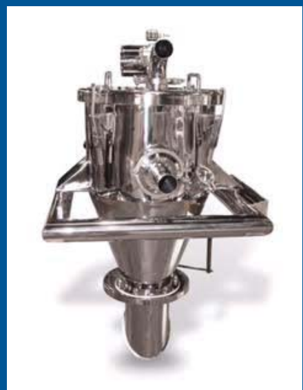
Typical VAC-U-MAX Powder-Handling Receiver for Batch & Continuous Operation

Know how many pick-up points and what type of sources bulk materials will be delivered in. Material may be located in different places from different sources; a 30-gallon drum from one supplier and a 50-lb bag, supersack, or bulk bag from another. A vacuum conveying system can't pickup from multiple points at the same time since air takes the path of least resistance.