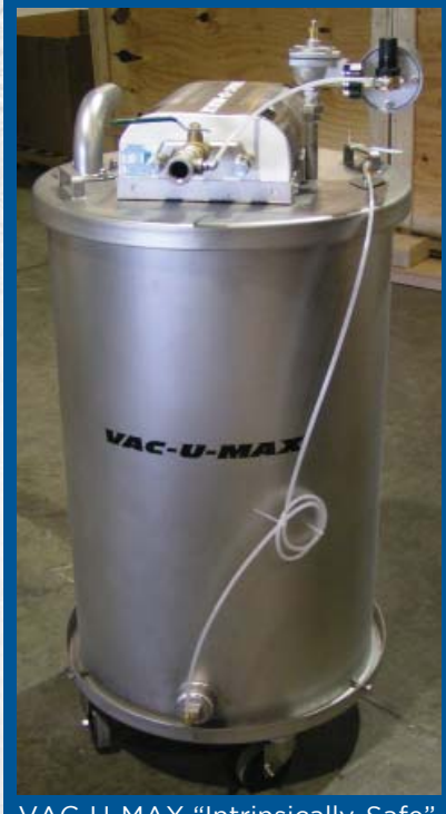
VAC-U-MAX "Intrinsically-Safe" Compressed-Air Powered Industrial Vacuums Meet NFPA 70 Requirements for Grounding & Bonding

The expense of retrofitting equipment is justified, compared to the risk to human life and the high dollar cost of a dust explosion. Once equipment is retrofitted, it should be checked out regularly to make sure the dust handling components are in good condition and working properly. Specialized vacuum cleaning and pneumatic conveyer systems can be an important part of a program for handling combustible dusts.