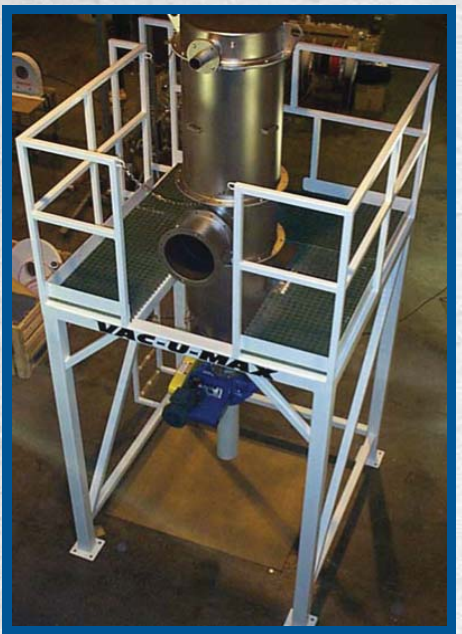
VAC-U-MAX Central Vacuum System with Explosion-Proof Venting

Explosions commonly begin inside a piece of equipment, like a dust collector or a dryer, or inside process equipment, so a thorough inspection will include the insides of all equipment. There are a number of ways of dealing with that type of risk. One is through an explosion vent, which directs the force through a certain exit, in a direction that will not put any workers at risk. Another choice is a fire suppression system inside the equipment. The device sprays dry chemicals into the chamber to suppress the explosion. Lastly, the potential for injury and damage can be minimized by investing in equipment heavy enough to withstand an explosion without falling apart or deforming.