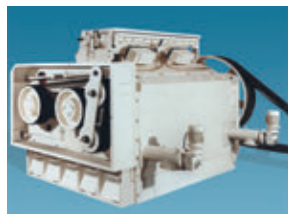
Rear View With Optional Recycle Screws