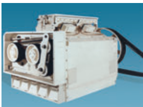
Rear View With Differential Drive Showing