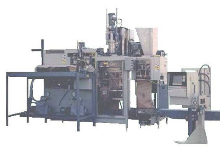
AutoTrim Flour Packer

Thiele Technologies AutoTrim® Packers are completely automatic, integrated bag packaging systems. They offer automatic bag feeding, registration and positive bag opening, dual auger product handling and bulk filling, vibratory top-off station, and positive bag control throughout the system.