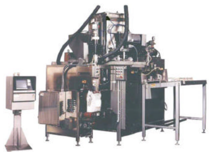
AutoTrim Chemical & Mix Packer