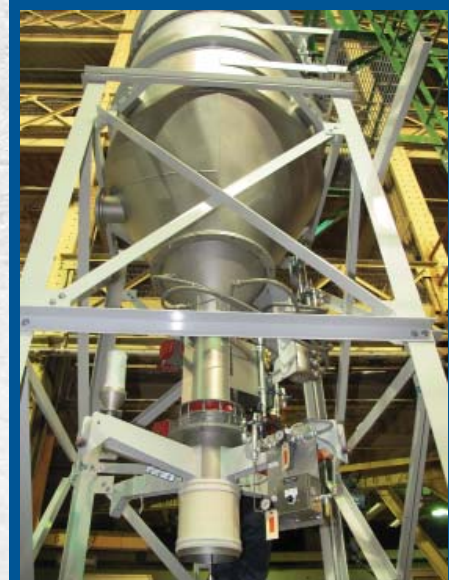
VAC-U-MAX Filter Separator and Bulk Bag Loader for Carbon Black

• Vacuum Receivers: The Heart of a System: Vacuum Receivers should be customized based on the application, material conveyed, rates, and distances. Receivers are designed to hold enough material to refill loss-in-weight feeders, or any “Discharge on Demand” systems. As most powders are not free-flowing, considerations should be made whether a tube hopper is appropriate, to ensure that the powder is completely discharged. In some instances, large area cartridge filters are an option, with air-to-cloth ratios of 7:1.